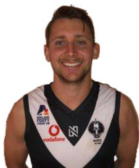
Men's Division 1 Leading Goalkicker: