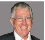
Stephen Baxter (2011)