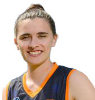
Women's Division 1 Leading Goalkicker: